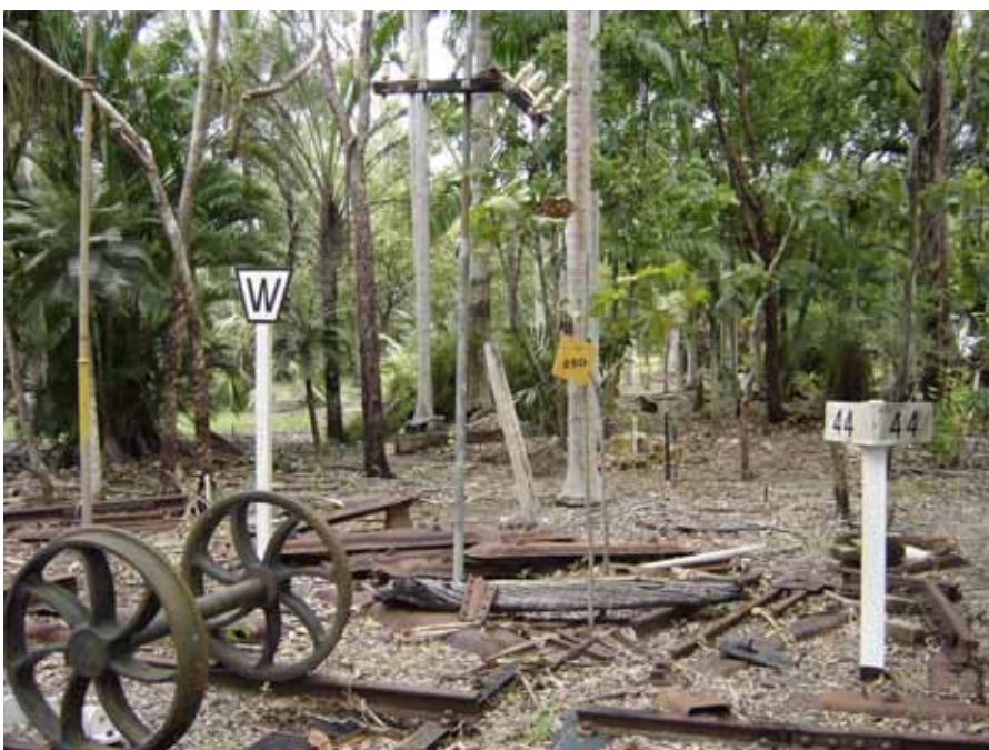
Left: at Chateau Hafta-Do, there is a wealth of material. Watch it and weep! Here we have remnants of sleepers (various), fish plates, the Overland Telegraph line, rail posts, carriage wheels and myriad other treasures nestled in tropical gardens. Eccentric? No way!