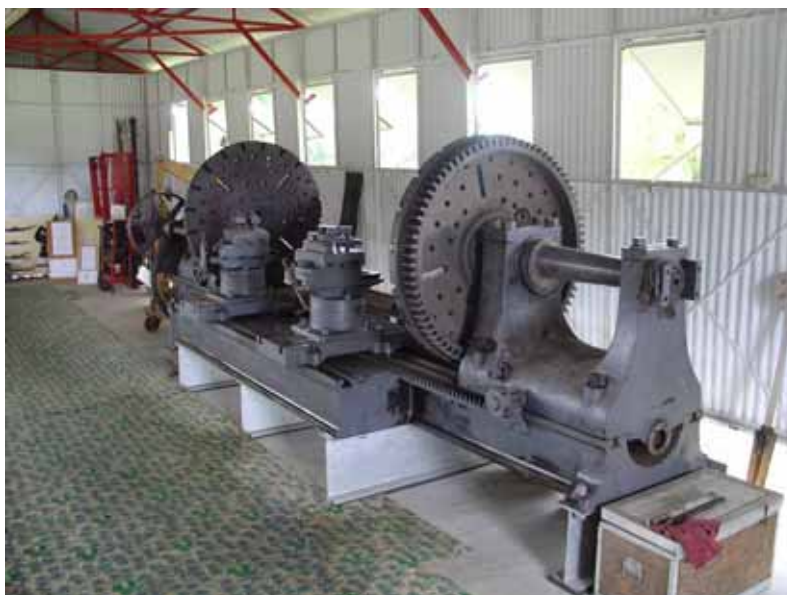
The wheel lathe in its new home at Adelaide River.

The heavy erection work is now complete. Owen took measurements for future work, such as mounting arrangements for the electric motor, machinery guards to protect little fingers, lubrication, replacing some missing nuts and then sourcing minor components like lathe tools