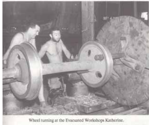
Wheel turning at the Evacuated Workshops Katherine.