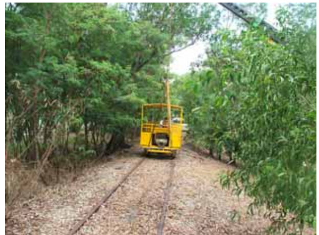
This is how we attract volunteers: we bribe ‘em!