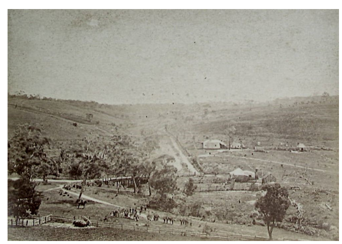
Jan Juc (Bellbrae) township