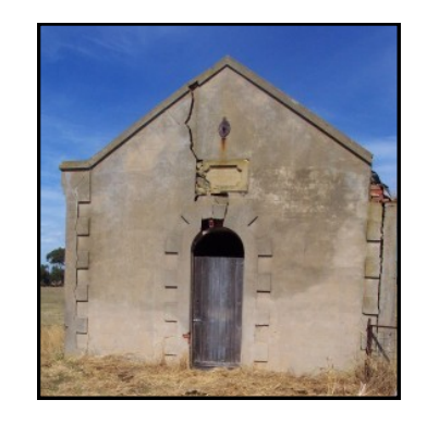
Moriac Church still stands as a hay Shed

He envisaged Modewarre and Moriac as big towns of the future. He thought Layard was going to be a satellite town, so he purchased a wooden house, and six acres that had been surveyed into house blocks. Modewarre needed facilities so he built a wooden general store, just near the new stone Bridge Inn, along what was to be the highway (now Cape Otway Road). He built other general; stores at Moriac and Mount Moriac.