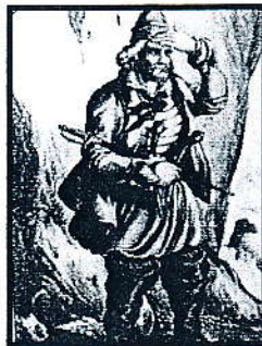
A Smuggler c.1820