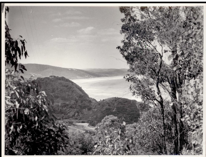
"At the end of the little track we looked down on grassy creek"

Edna eventually left the land to the Bird Observers Club. She was reluctant to leave but in the event "within the week, a bush fire swept up the hill and burnt up the little place leaving only the stone walls, stairways and paving built with so much joy".