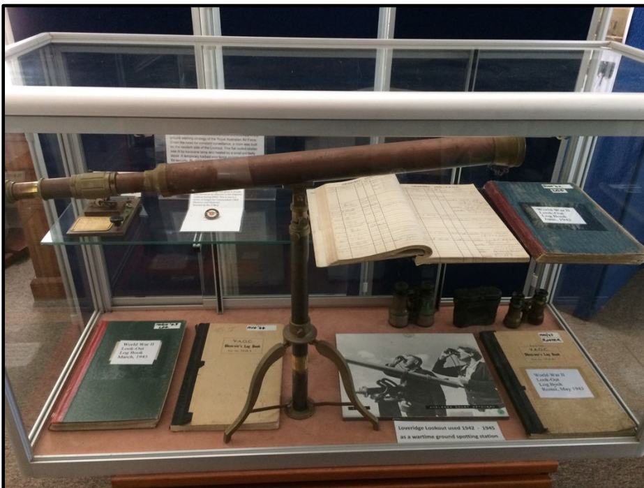
The Loveridge Lookout display at History House which will be part of the War Memorial display early next year.

A ceremony to officially open the Memorial Wall is planned for Sunday 14 November at 1.30pm and everyone is welcome to attend. The flags will be unfurled for the first time and the guest speaker is Michael Ronaldson. An exhibition originally intended to coincide with the opening has been postponed due to the current lockdown and will now be held Saturday 30 April to Monday 2 May. It will tell the stories of many of the men and women named in the plaques. Told in themes it will focus on people from Anglesea to Bellbrae and Eastern View, from farmers to lighthouse keepers to war artists and military surveyors. It will be augmented by displays featuring the original Anglesea Avenue of Honour, the work of the Air Observers Corps at Loveridge Lookout, the commemoration at the RSL and the building of the Anglesea Memorial Hall.