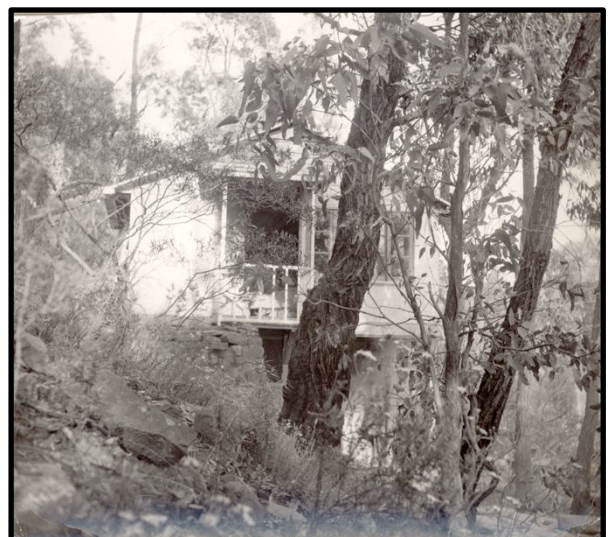
"The chalet through the ironbarks"