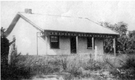
One of the houses built for the Forestry Pine Plantation workers.

Most people thought the Pine Plantation development at Anglesea, after the First World War was a disaster. The pines did not grow as anticipated. Although many men were employed to prepare the ground, plant the seedlings and care for them, the experiment was not successful. The ground was not fertile enough and the rainfall was too low. A lot of time and money was wasted and fire eventually took most of the poor specimens of trees that struggled to survive.