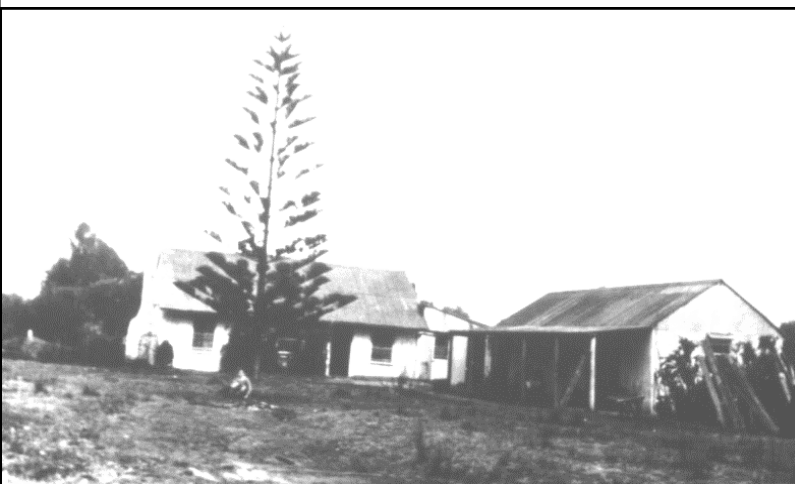
The Neuk before it was destroyed in 1983 fires