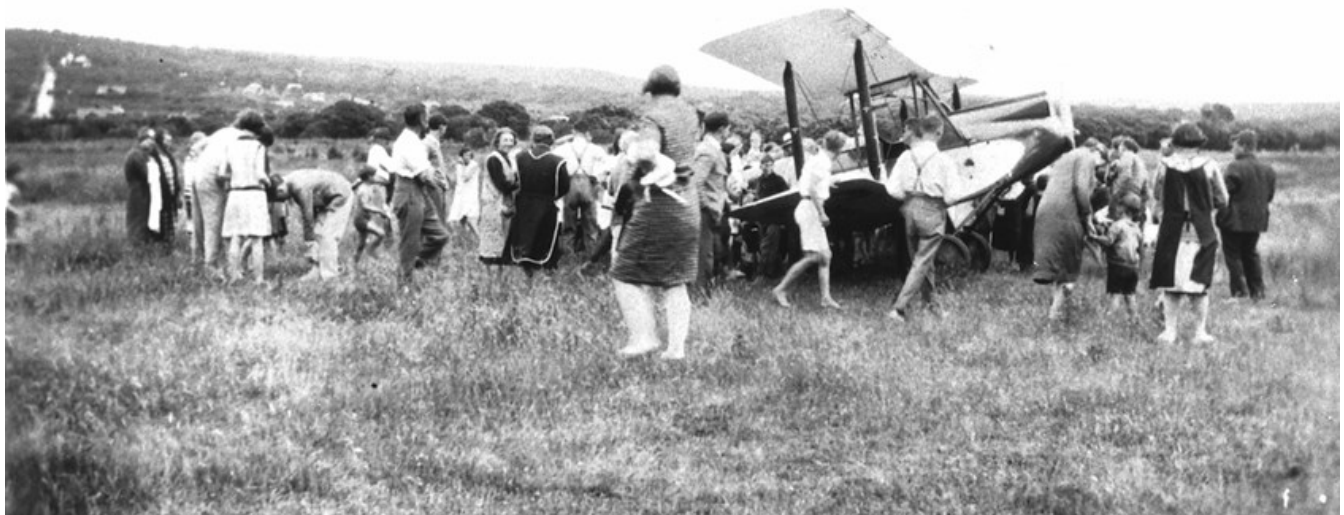
Pratt's plane giving joy rides on New Year's Day 1930

Pratt continued with his flights, including popular joy flights over the Surf Coast for many years.