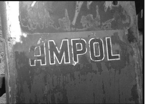
Parts of the pump during restoration