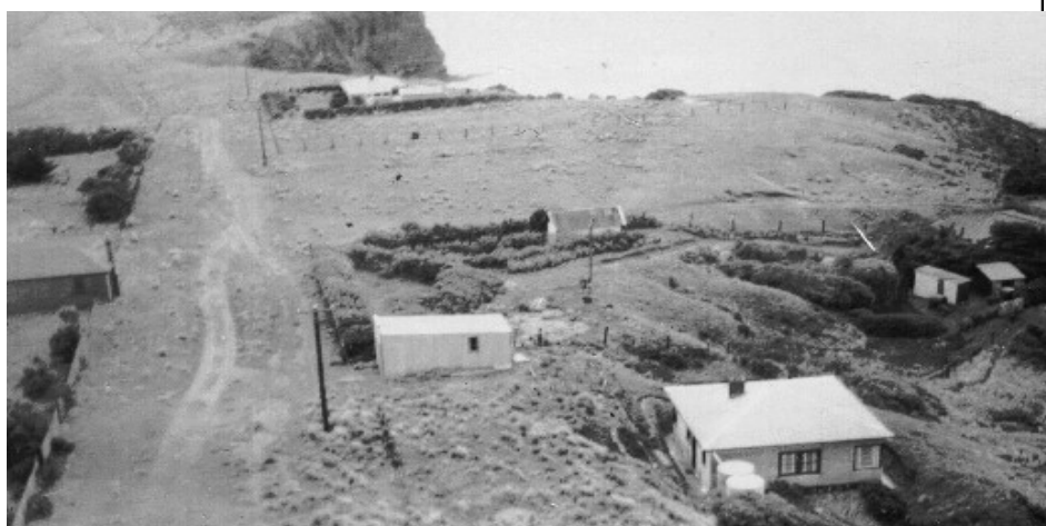
Federal Street, Aireys Inlet c. 1955

were woollen ones, which always chaffed when worn for the whole day. My friend, who lived down Lighthouse Road, had a canoe, so both of us would lug it down to the river and have great fun in it or under it. No being driven anywhere, we always had to walk everywhere. The only place we were driven was to Hartley's farm to get cream for both the neighbours and ourselves. During the 1939-45 war we had to have all our windows covered up. Special frames were covered with brown paper so no light could be seen by enemy ships.