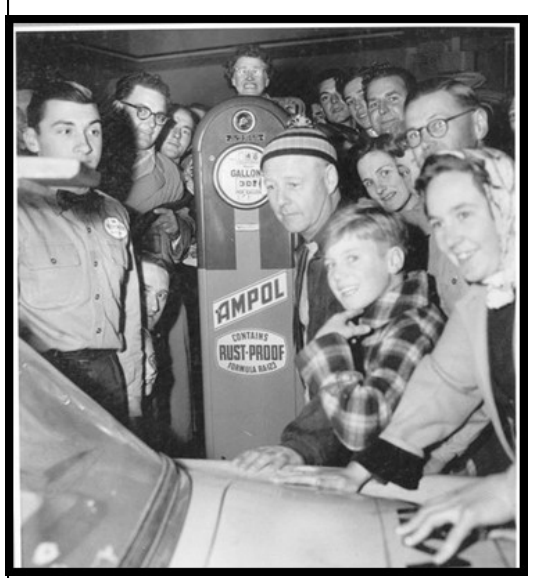
Jack Davey (a 1950's popular radio personality) refuelling during the around Australia Redex Trial.