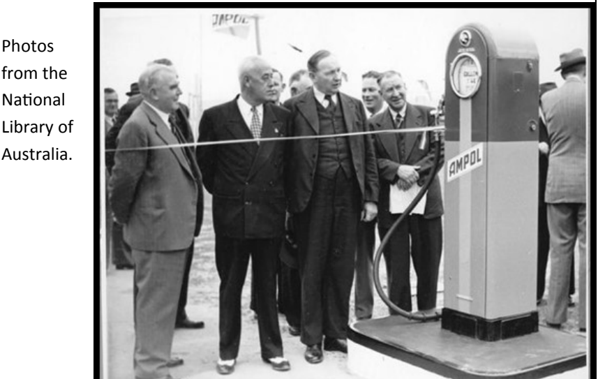
Thomas Playford (1950's South Australian Premier) interested in the New electric petrol pump during the opening of the Birkenhead (SA) terminal, 29 Sept. 1950.