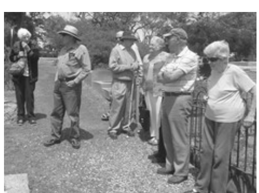
Part of the Historical Society Group at the Bellbrae Cemetery.