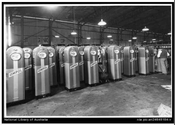
Rows of new Wayne pumps in storage being readied for installation, 30 September, 1950.