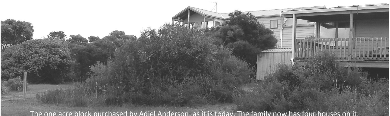
The one acre block purchased by Adiel Anderson, as it is today. The family now has four houses on it.

The joys of holidaying at Aireys Inlet remained with the family and they continued to visit Aireys regularly. They stayed at either Mountain House or the Inlet Hotel . Olive had the garage extended into a holiday house. In