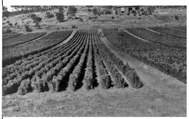
The Pine Nursery at 'Norsewood' Camp Road, Anglesea c.1929

Fire became their constant enemy and the Commission cleared 300 acres of timbered country to provide fire