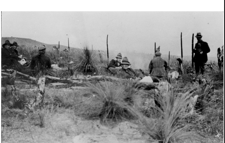
Teabreak as workers prepare land for planting of pine trees c.1927

Planting huge tracts of pine trees in Anglesea's otherwise wasteland seemed a good idea at the time. As early as 1920 with troops returned from WW1, the government was looking for projects to provide employment. The Forest Commission was reported to be prepared to pay five shillings an acre for the land, but in the end they just obtained it through a transfer from one government department to another. It is interesting that the Forest Commission was prepared to pay only five shillings an acre for the land, when government land had been a minimum of one pound an acre from 1848 under pre-emptive right.