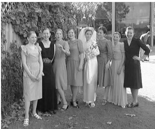
Launch on 25 July at Unley Museum of the latest exhibition, "Was your Granny Groovy?" Year 10 students from Concordia College presented a fashion parade of clothing from the 1940's.