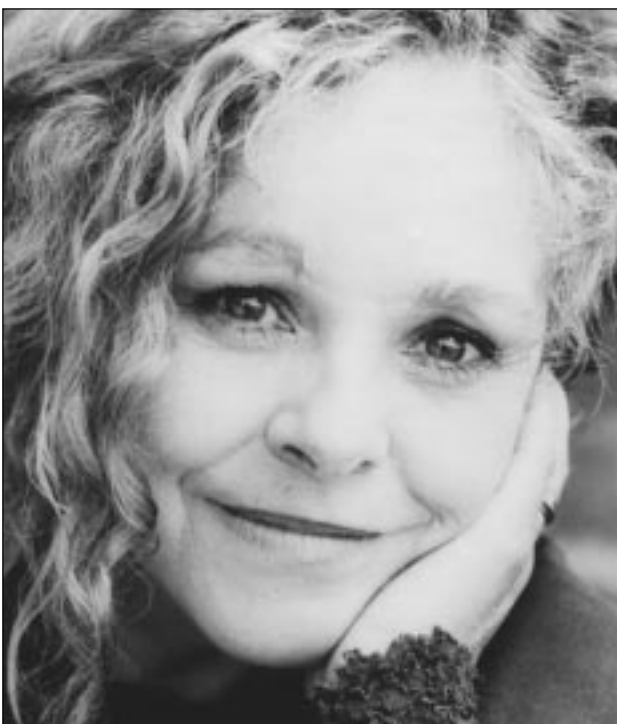
Lynette Curan, actress

"One thing I have noticed is that you do not immediately turn into a kind, decent or agreeable person as you turn into an older person. Who we are and how we have lived our lives will accumulate to define what we become as we age".