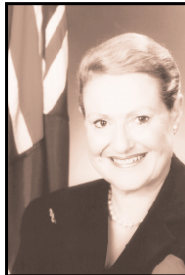
Bronwyn Bishop, MP

With Government, the community and the corporate sector working together, I believe we can create a society in which old age is a time to be enjoyed not endured.