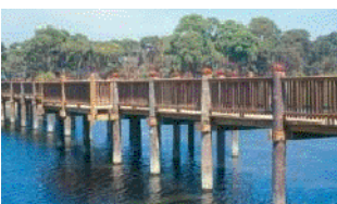
Laverton Creek Bridge