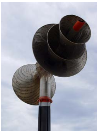
The Time Beacon