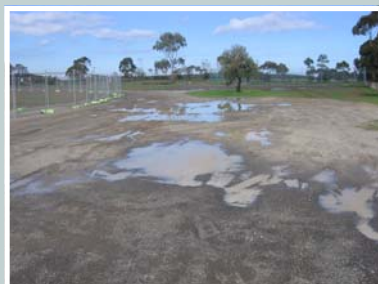
HD Graham Reserve Car Park

Welcome to the second edition of the ABAGRA NOW Newsletter., providing information and updates to the residents of Altona Bay and Altona Green area.. Our Newsletter is also downloadable from our Website This edition is full of information about what ABAGRA has been up to since its inception in March this year. As the editor, I am always looking for information to include. If you have anything that you would like us to include in a future newsletter, or if you would like to assist in its publication, please contact us on 0419 222 092 or email abagra3028@gmail.com .