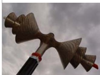
FOR THE FUTURE