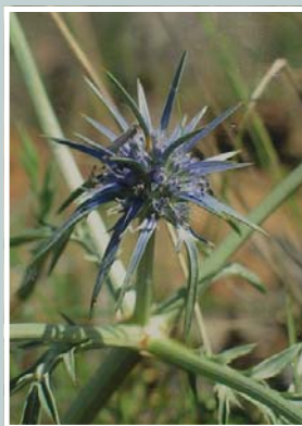
BLUE DEVIL GRASS

The area designated as Cheetham Wetlands has been Internationally listed by the World Heritage Foundation . This significant area supports an abundant range of Wild Life & Flora. The Blue Devil is one of the more