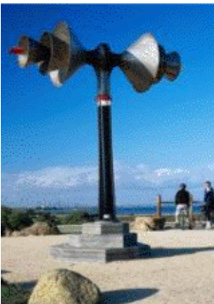
The Time Beacon