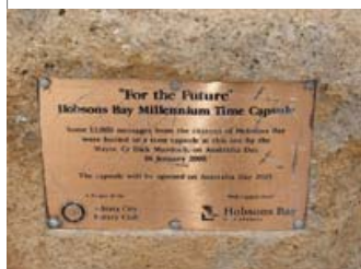
TIME CAPSULE - 2025

ALL FUNDS RAISED BY THIS INITIATIVE GOES BACK INTO OUR LOCAL PARKS