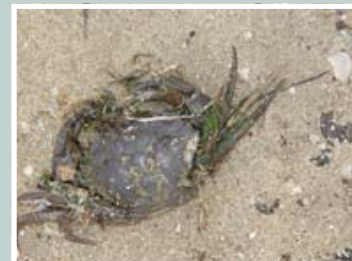
A LOCAL INHABITANT

Please remember to dispose of all your litter properly; Particularly in public places such as bus stops & train stations, around shops & food outlets. FOR A CLEANER ENVIRONMENT