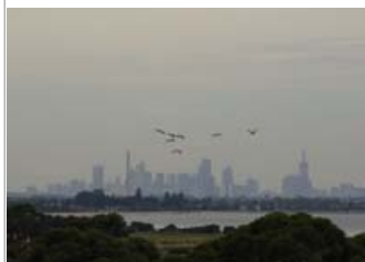
FLOCK OF PELICANS