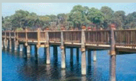
Laverton Creek Bridge

Welcome to the first edition of ABAGRA Newsletter. It is hoped that we will make this a quarterly newsletter, providing information and updates to the residents of Altona Bay and Altona Green.