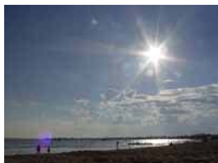
Altona Beach - Sunset