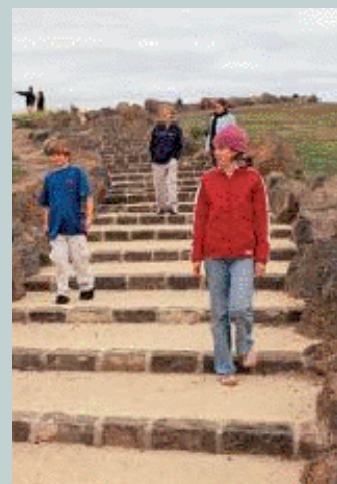
100 Steps to Federation