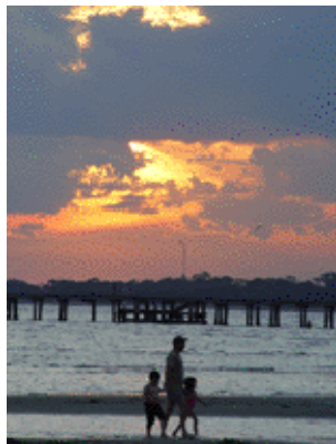
Altona Pier - Sunset