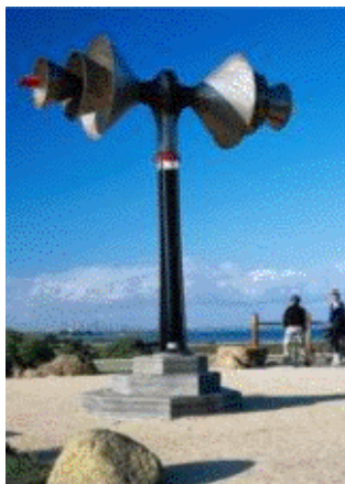
The Time Beacon