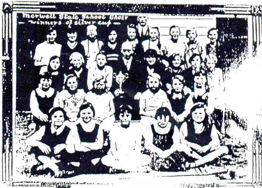
Morwell State School Choir (Commercial Road) winners of a State Choral Competition 1934-35