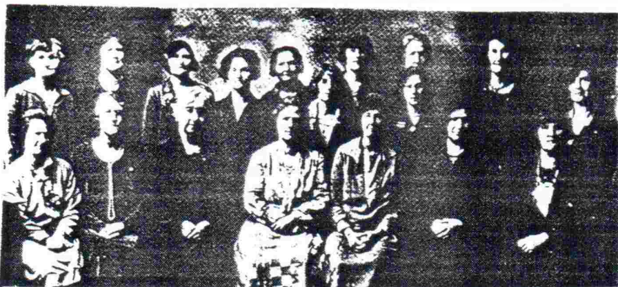
TRARALGON STATE SCHOOL MOTHERS' CLUB, 1928