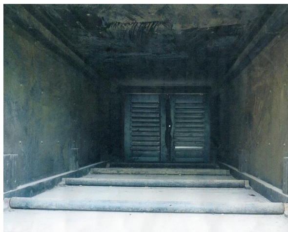
The Rail truck which carried the coffin