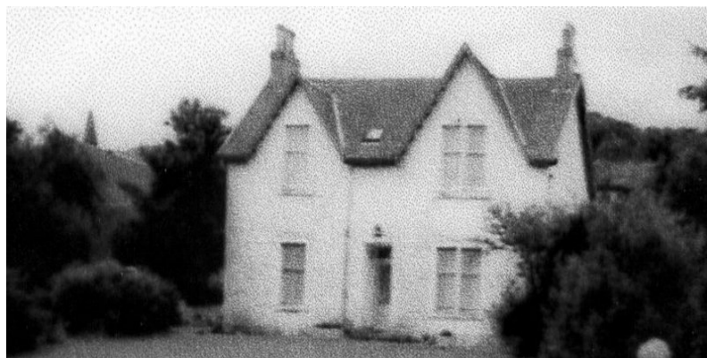
"Clady House" – Home of the Clock 1850's

The Clock continues on it's journey through the generations of my family, acting as a link between the past and the present. It's working life has finished, no longer needed to tell the time, but it stands as a reminder of past family members and their connection to us.