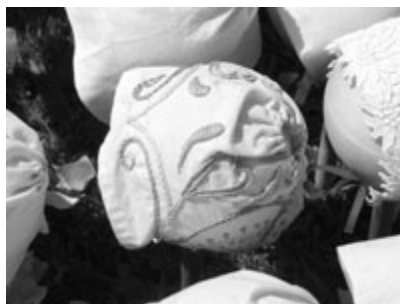
Bonnet pictures