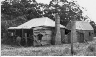
Lugg's old house at Aireys Inlet as it stood in 1971.