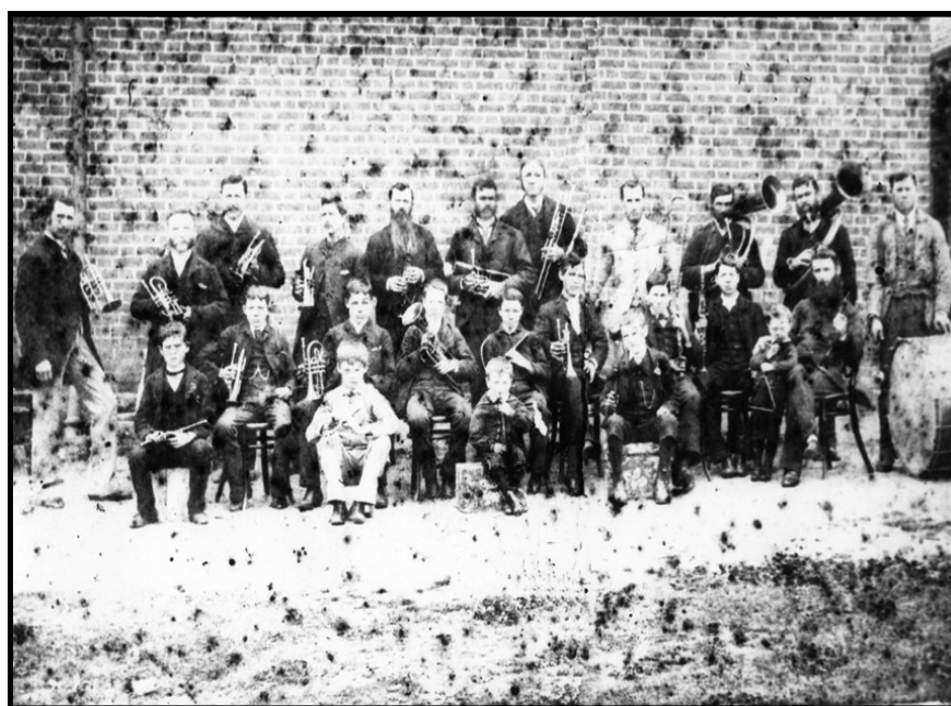
Gulgong Band 1890 (date possibly incorrect). Leader at left of photo has strong resemblance to my husband. Enhanced - original available.