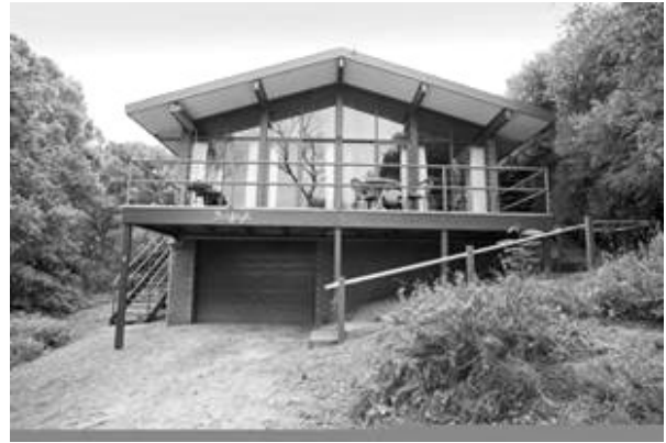
Ponfeigh as it stands in Bambra Road today