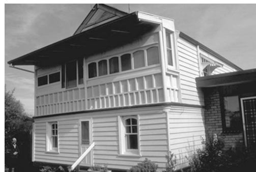
24 Pride Street, incorporating a deckhouse