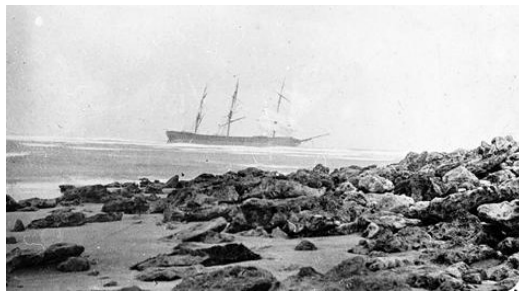
Joseph H Scammell on the reef at Point Danger