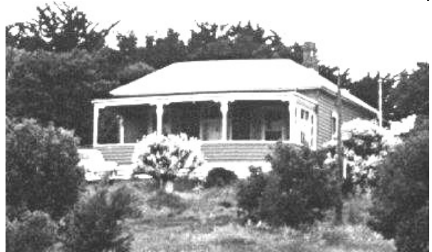
The original Kontiki built 1891

When my children were small we stayed at a friend’s holiday house in Anglesea. We were soon entranced by the nearby hamlet of Aireys Inlet with its lighthouse, bark hut and lagoon. Many years later the opportunity arose to buy a beach house at Aireys Inlet - my dream come true! The brief from my husband was that it