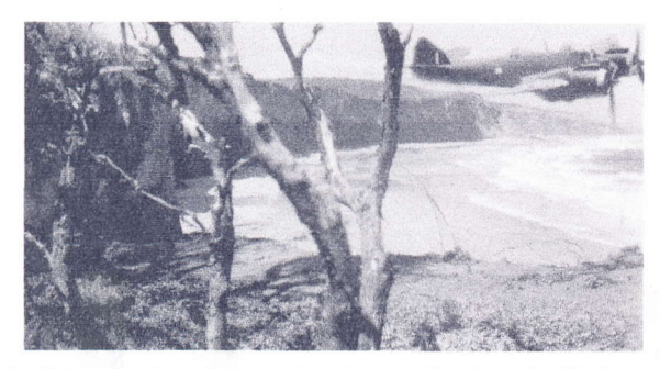
Until Pt. Cook training school recently closed, flight maps designated our coastal area as - restricted RAAF airspace.

ecently a plaque was unveiled at Pt. Addis to commemorate wartime activity along the Surf Coast. As you know there was once a RAAF camp there, plus a bombing and gunnery range out to sea.