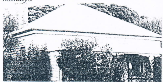
The Webb's holiday cottage

here's a quaint single fronted cottage, coloured white with red roof, facing the River Esplanade just three doors south of Parker Street - you would have passed this many times. It was first owned by the Webb family from Newtown, who always stayed there for the duration of the Xmas school holidays.